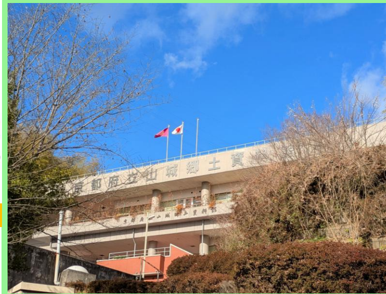
Hometown Museum Yamashiro (Kyoto Prefectural Yamashiro Local History Museum)

Event Information April 2026 ~ March 2027