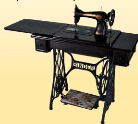
Treadle sewing machine