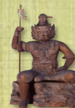
Seated Wooden Statue of Gazu Tennō (Collection of Matsuo Shrine, Kizugawa City)