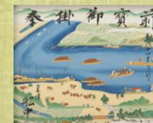
Restored wooden votive plaque from Kizu ship (Owned by this museum, the original is held by Goryo Shrine in Kizugawa City)