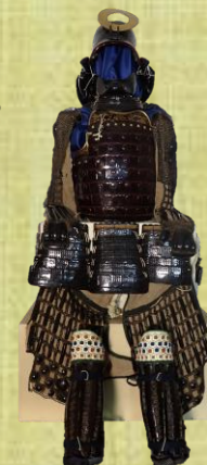
Contemporary Armor (In the collection of the Sōraku Eastern Region Wide Area Union Board of Education)